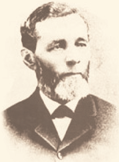
Benjamin Tyler Henry. His invention: The Henry Rifle.

Thank you for purchasing your new Henry Lever Action Rifle. We are proud to have crafted this rifle for you in the great tradition of Henry Repeating Arms Company which dates back to 1860 when the first effective, lever-action repeating rifle was developed by our founder, Benjamin Tyler Henry. We go to great efforts to provide the highest quality of design, craftsmanship, manufacture and function that was established over 140 years ago. Your new Lever Action Rifle should provide you and your family with many years of safe enjoyment and pride of ownership.