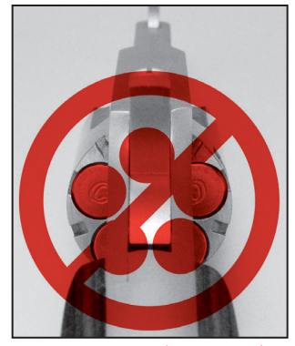
No-Hammer on live cartridge