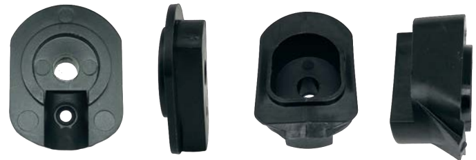
Mossberg 500/535/590/835 12ga & 20ga (proud fit) Maverick 88 12ga & 20ga (proud fit)