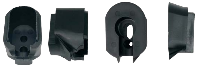
Remington 870/7400 12ga

Slide the backstrap off of the pistol grip as seen in (Figure 2).