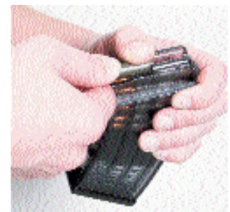
Loading the magazine.

WARNING! When the safety lever is in its horizontal position on the receiver, the safety lever is in the off or "FIRE" position. Pulling the trigger when the safety lever is in this horizontal position will result in the rifle firing a round. To avoid serious injury, death or causing property damage, make sure you know the "SAFE" and "FIRE" positions of the safety lever before attempting to load your rifle! (continued on page 6)