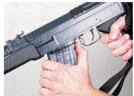
Illustration # 4

To install or remove the magazine, press the magazine release lever forward.