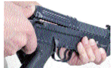
Illustration # 6

Press the receiver retainer/takedown button to begin disassembly.