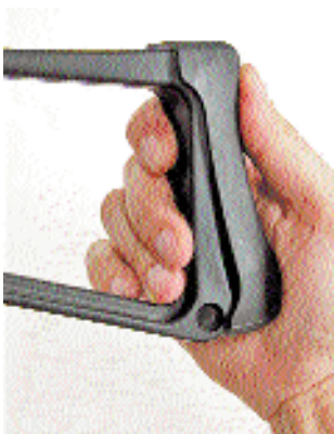
Illustration # 11

To install the recoil pad, align the four studs with the four holes in the base of the stock and press into place. The wider end of the recoil pad is placed at the bottom of the stock and the narrow end at top.