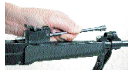
Illustration # 9