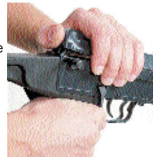
Illustration # 7

Grasp and pull the return mechanism out of the receiver.