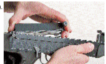
Illustration # 8

Grasp and pull the return mechanism out of the receiver.