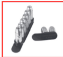
DoubleTap™ Loading Devices