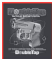
"GO LOUD" T-Shirt