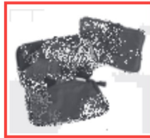
MOLLE Deployment Pouch