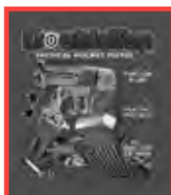
"NO FOREIGN MADE" T-Shirt