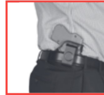
Belt Clip Holster