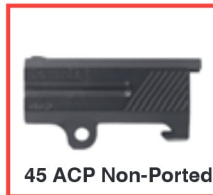
45 ACP Non-Ported