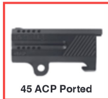
45 ACP Ported