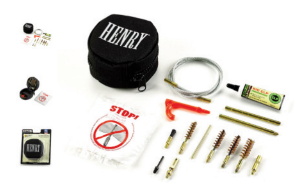
Henry Otis Centerfire Cleaning System