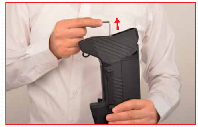
11. Unscrew both screws with an allen wrench.