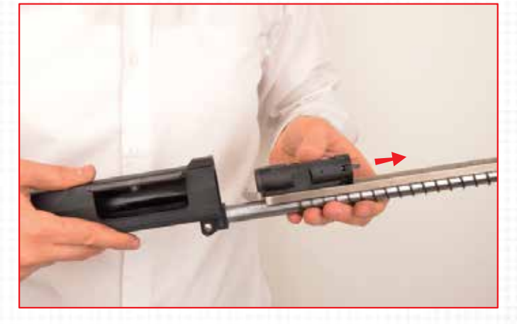
17. Pull the bolt assembly in arrow direction and remove it carefully.