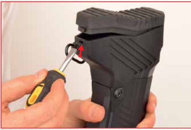
10. Remove the recoil pad with tool. At this stage you can add or remove additional spacers.

9. At this stage you can clean or replace the gas piston.