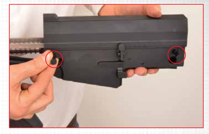
15. Push the pins in the front and the back, and pull them from the other side until they unlock.

14. The pins are used to seperate the upper from the trigger housing.