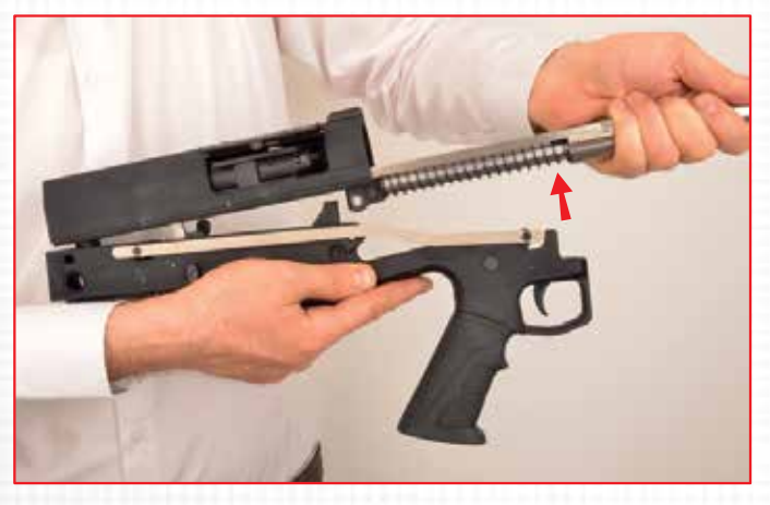
16. Slightly push the bolt assembly backwards until it unlocks. Then seperate the trigger housing from the upper by pulling in arrow direction.