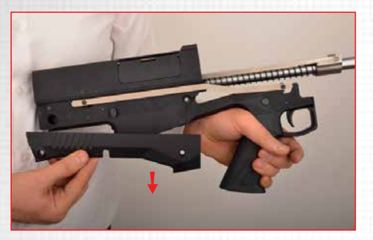
13. Remove the the covers located on both sides carefully.