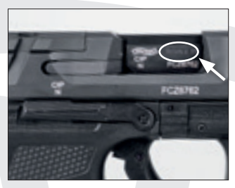
2 Fig. 1

Locate the cartridge designation marked on the handgun. This information indicates the ammunition that must be used in this firearm (see 2 Fig. 1). You are responsible for selecting ammunition that meets industry standards and is appropriate in type and caliber for this firearm.