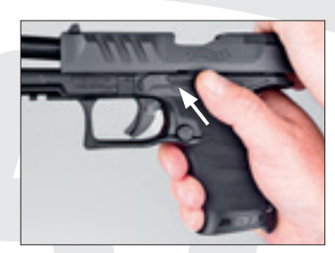
3.2.3 Fig. 1

Grasping the grip of the frame and with your finger off the trigger and outside the trigger guard, depress the magazine release, and completely remove the magazine. Firmly grasp the serrated sides of the slide. While steadily holding the grip, briskly pull the slide fully rearward to extract any cartridge from the chamber and clear it from the pistol.