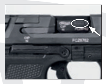
2 Fig. 1

Locate the cartridge designation marked on the handgun. This information indicates the ammunition that must be used in this firearm (see 2 Fig. 1). You are responsible for selecting ammunition that meets industry standards and is appropriate in type and caliber for this firearm.