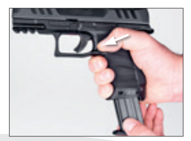
3.2.2 Fig. 1

Grasp the pistol with your finger off the trigger and outside the trigger guard. Depress the magazine release and remove the magazine (3.2.2 Fig. 1).