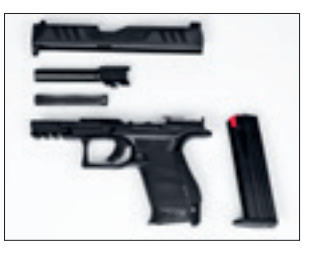
5.1.1 Fig. 7