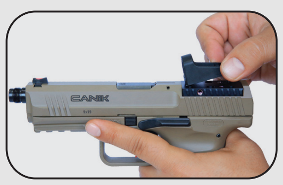
Illustration # 27

Please use only mounting screws that are included with your pistol to mount the sight.