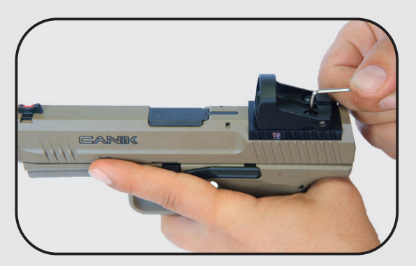
Illustration # 28