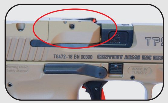
Illustration # 2

This pistol is equipped with a loaded chamber indicator. When the chamber is loaded it is raised from the slide (See illustration #2). When the chamber is empty, it is flush with the slide (See illustration #3)