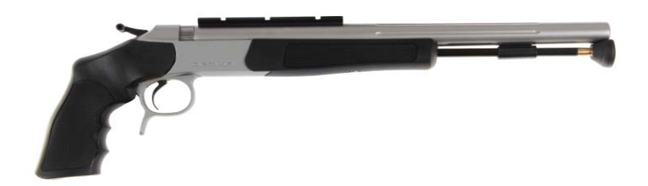
*See Pistol Loading Information on page 9.