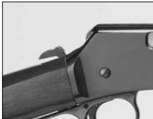
The hammer shown in the full-cock position.