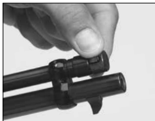
Depress the latch and pull the magazine tube out.