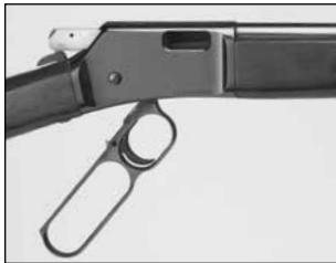
The finger lever in the fully down position.