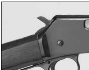
The hammer shown in the dropped or fired position.