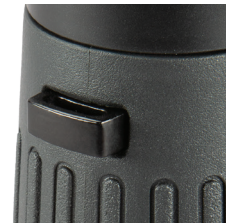
Fig. 5 Strap Lug

To attach the neckstrap, thread the ends of the neckstrap through the strap lug ( Fig. 5 ) on each side of the binocular, then back through the plastic buckle on the strap ( Fig. 6 ). Adjust the position of the binoculars on your chest as they hang around your neck to your preference, by changing the length of the strap section which passes through the strap channel and buckle by an equal amount on each side. If you prefer to use an aftermarket strap that has metal O-rings, attach them to a plastic zip tie placed on the strap lugs rather than installing them directly on the lug, to avoid damaging the finish on the binocular via contact with the rings.