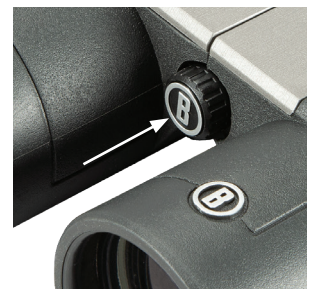
Fig. 7 Tripod Socket Cap

To attach the binocular to a tripod or monopod (feature provided on some full size models), unscrew or pull off (varies with model) the cap which covers the threaded (1/4-20UNC) socket at the far end of the center hinge ( Fig. 7 ), and set it aside in a safe place. Use a compatible binocular tripod adapter accessory (90° angle bracket), such as the Bushnell #161002CM, to attach your full size binocular on any standard tripod in a horizontal position, to provide a stable image during prolonged viewing, or when using high power models.