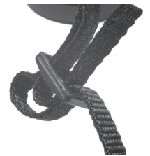
Fig. 6 Strap & Buckle