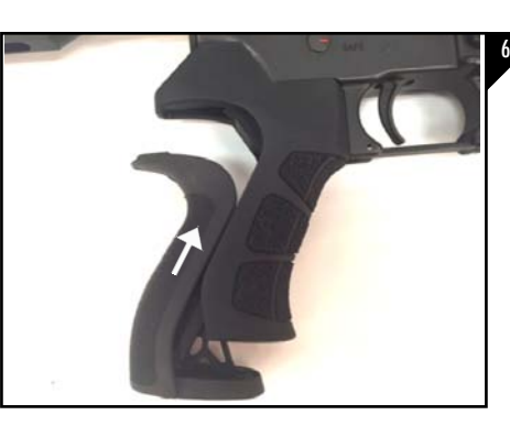
Re-install the Scorpion Recoil Pad by sliding it upward into the pistol grip as seen in Figure 6.