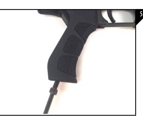
Insert the grip bolt through the bottom of the grip and tighten using a 3/16" standard allen wrench as seen in Figure 5.