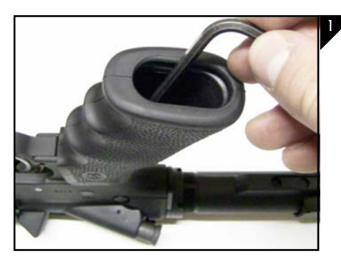
Begin by flipping the gun over and locating the bolt inside your current grip stock. Loosen the applied screw with a 3/16" standard allen wrench, and begin removing the grip as seen in Figure 1.

Warning: When handling a firearm, always follow the proper handling procedures at all times. Failure to follow these procedures could result in serious damage, injury, or death. We is not responsible for damage to property, injury, or death resulting from improper installation, misuse or modification of products. If you are not comfortable completing any of the following steps, or do not have the proper tools enlist the help of your local gunsmith. We are not responsible for components that are damaged due to improper installation.