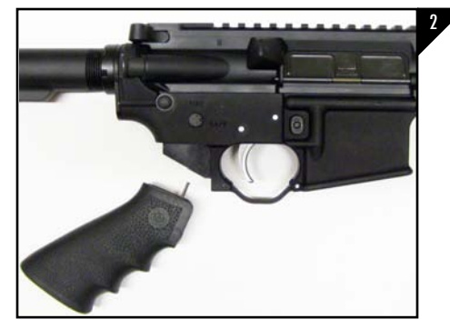
Continue to remove the grip completely. Be careful to remove the safety selector spring from the grip as seen in Figure 2. Keep both the safety selector spring and grip bolt for later installation.

NOTE: Be sure the safety selector spring is aligned into the safety selector detent hole before the pistol grip is fully in place.