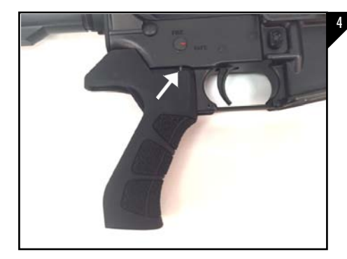
Insert the safety selector spring into the designed hole on the ATI AR-15 X2 pistol grip. Next, slide the pistol grip into place as seen in Figure 4.

NOTE: Be sure the safety selector spring is aligned into the safety selector detent hole before the pistol grip is fully in place.