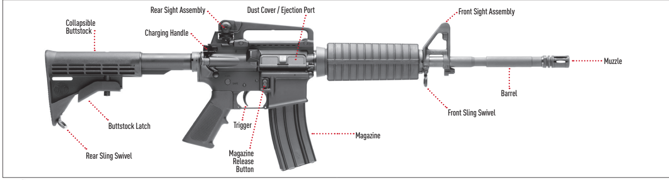
FN 15<sup>™</sup> right side, Carbine shown.