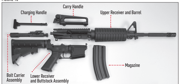
FN 15<sup>™</sup> subassemblies.