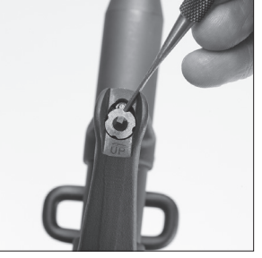
Use a punch or similar object to adjust the front sight post while zeroing.