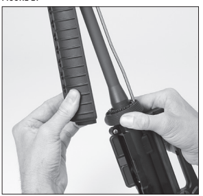
Install the handguards.