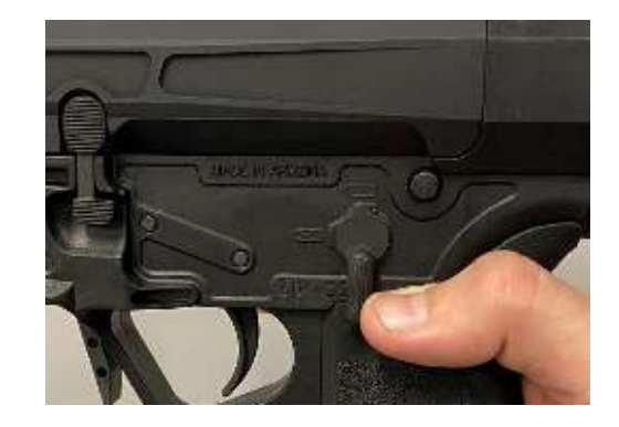
Figure 1 "SAFE"