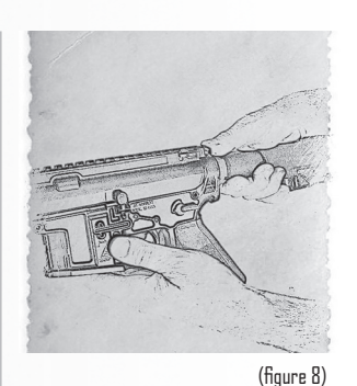
FUNCTIONS CHECK - TRIGGER RESET

While holding the trigger to the rear on an empty chamber and while the safety selector is still on "Fire", pull back on the charging handle and release (figure 5). Slowly release the trigger until you feel and hear an audible "click". This is your trigger resetting from the disconnector to the hammer. This is all the forward movement necessary to reset the trigger for your next shot.