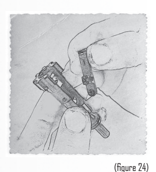
FIELD STRIPPING -BOLT CARRIER (CONTINUED)

Hold the bolt carrier as shown; the firing pin should fall loose (figure 21).