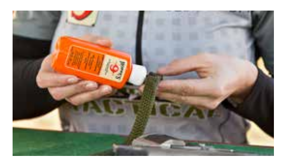
STEP 2. Apply a few drops of Hoppe's No. 9 Lubricating Oil to the Boresnake's tail.