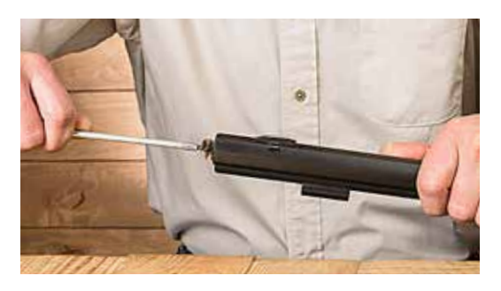
After two or three shots, apply Hoppe's No. 9 Black Powder Cleaner & Patch Lubricant to a bronze brush and run it down the bore and back.

FINISH THE JOB. Wipe down the muzzleloader's metal surfaces with a clean cloth. Switch to a Hoppe's Triple Threat Cloth and polish metal to a high luster.