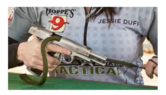
STEP 3. Drop the BoreSnake's brass weight through the opened action and down the bore pulling it through until it comes out of the muzzle. Congratulations. The bore is now completely cleaned and protected from the harmful effects of carbon buildup, metal fouling and moisture.