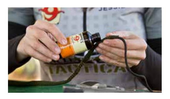
STEP 1. Apply a small amount of Hoppe's No. 9 Bore Cleaner to the head of the BoreSnake, just ahead of the bronze bristles.

See page 12 for BoreSnake head, tail and everything in between.