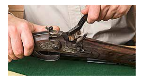
Once you are finished shooting for the day, it's a good idea to clean the flash channel. Use a hand-held bronze brush dipped in the bore cleaner to clean and scrub the nipple and hammer, or in the case of a flintlock, the frizzen and pan, and surrounding areas.