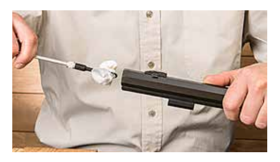
Replace the brush with a cleaning jag and run a series of patches through the bore until they come out clean. The bore is now cleaned, lubed and protected from corrosion.