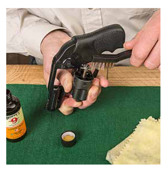
Use a bronze brush dipped in cleaner to scrub the back of the barrel, rear cylinder opening, cylinder faces and inner frame. Also scrub the extractor rod, the hammer face and landing.