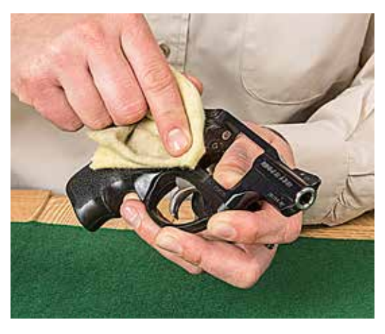
Finally, apply a few drops of lubricating oil to a cloth and polish all exterior metal. Switch to a Hoppe's Triple Threat Cloth and polish metal to a high luster.