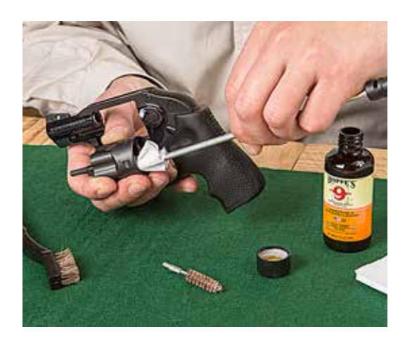
Follow the same procedure with each chamber of the cylinder. Next, attach the patch holder to the cleaning rod, apply cleaner and run it through the bore. Repeat until patches emerge clean. Run a dry patch through, apply a few drops of lubricating oil and make one final pass. Repeat the same step for the cylinder.