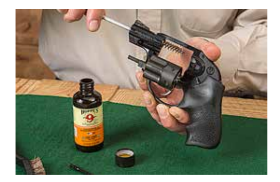
Apply Hoppe's No. 9 Bore Cleaner to a bore brush. Starting at the muzzle, run it through the barrel until it comes out the back side. Run it back out, and through again three or four times reapplying cleaner as needed.

Pull the cylinder retention pin and push the cylinder to one side. For single-action revolvers, the cylinder and pin come out entirely.