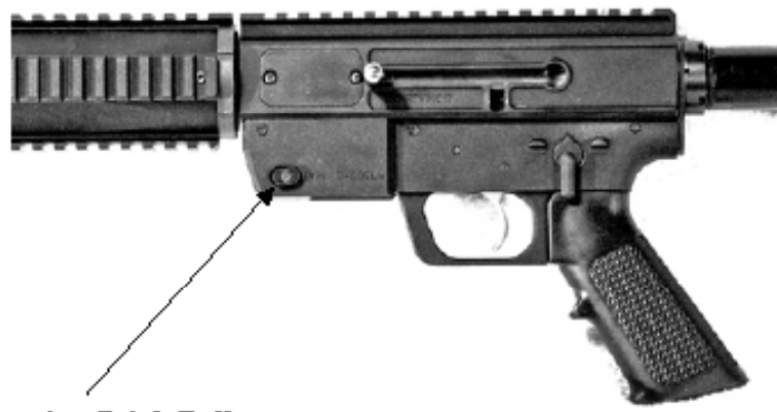
Magazine Catch Button

Unloading is accomplished by switching the safety lever from FIRE to SAFE, pulling the bott handle rearward and locking it into the bott catch. Pressing the magazine catch button (See fig 4.) will allow the magazine to be removed. Be careful to ensure that the chamber is empty.