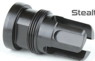
Stealth Flash Hider

The Resistance® 22M Suppressor has many accessory options to suit your specific needs. To see available parts visit our website.