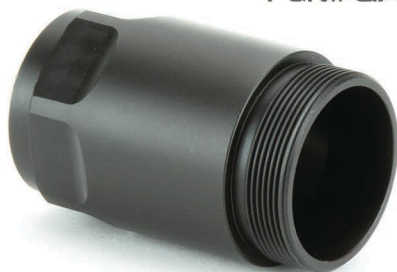
Taper Mount Conversion Part# GATMBS