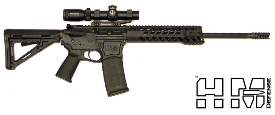
HM15 Rifle (optics not included)

The HM15 is a semi-automatic, direct gas impingement rifle capable of firing without a magazine. The CA Compliant HM15 is equipped with a "bullet button" magazine lock which requires a tool in order to detach your magazine.