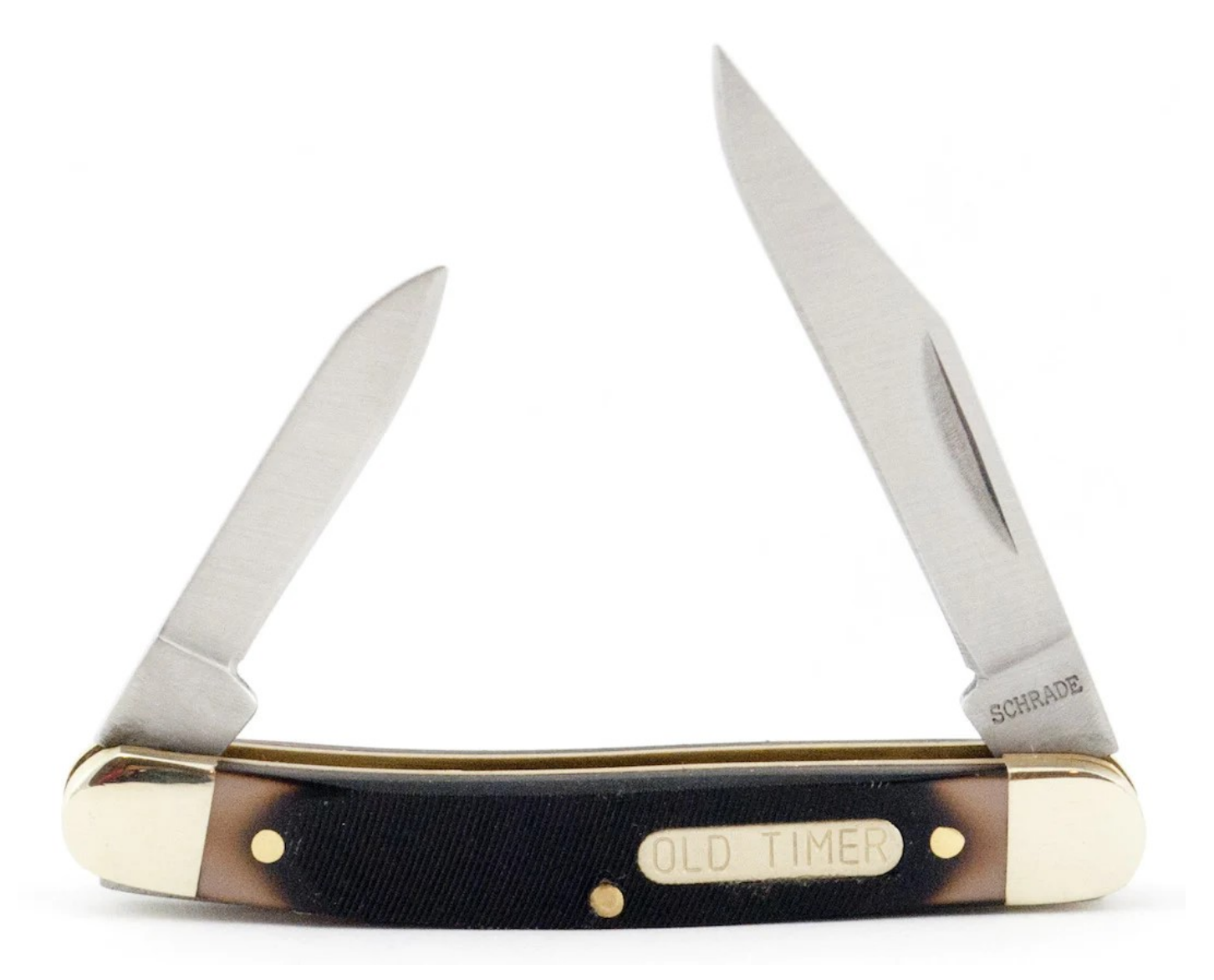
Taylor Brands Old Timer 104OT Minuteman

Not long after the doors were closed, Taylor Brands LLC quickly picked up the brand name to breath new life into the Schrade, Old Timer, Uncle Henry, and Imperial brands. Taylor Brands was already a licensed manufacturer of Smith & Wesson knives, so it was clear these knives were in good hands.