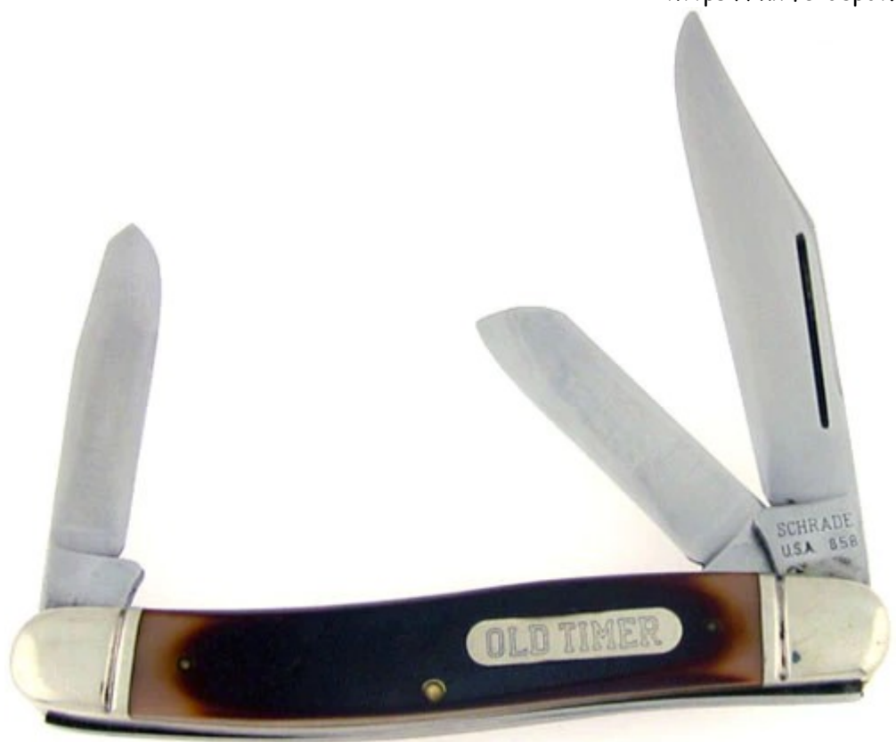
An original Schrade 858 Stockman

Schrade continued introducing new models into the Old Timer line, and the knives were always made to meet the high standards laid out by the company. (Schrade even released a <u>Bill of Rights</u> on what makes a great <u>Schrade knife</u> that included notes on the finish and craftsmanship.) The handles were consistently made of durable materials like Delrin and Staglon and featured liners made from solid brass.