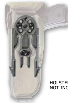
HOLSTER NOT INCLUDED