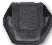
7335 EDW SINGLE POUCH