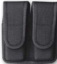
7302 DOUBLE MAGAZINE POUCH