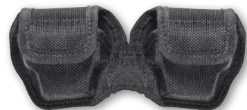
7336 EDW SINGLE POUCH