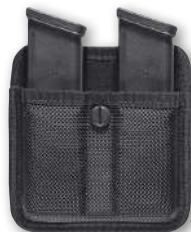
7320 TRIPLE THREAT™ II DOUBLE MAGAZINE POUCH