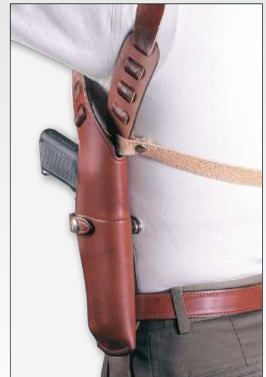
The X15 harness adjusts to fit male and female torsos up to an optional 52" (128cm)