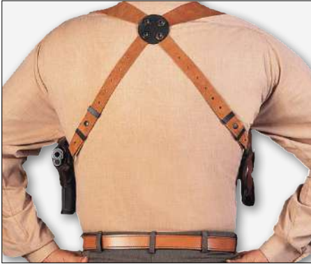
The X16 harness has a pivoting design that moves with the body and adjusts to fit male and female torsos up to 48" (122cm).