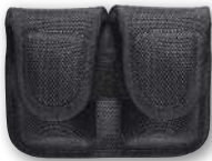
7301 SPEEDLOADER POUCH